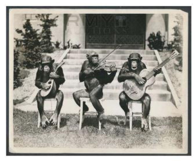
"Our next tune will be Gånglåt från Bananabo"

producing a sly grin along with a large letter "A" from his instrument case. His playfulness with words carried over into his harmonic sensibilities, which were light and supportive of the melody.